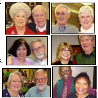
Some of the members and their spouses at the Christmas Party.